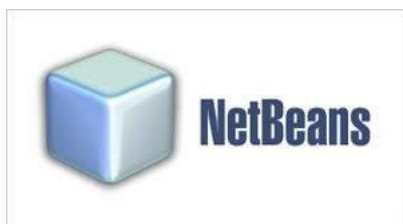
Fig 3: NetBeans

NetBeans is an integrated development environment (IDE) for Java. NetBeans allows applications to be developed from a set of modular software components called modules. NetBeans runs on Windows, macOS, Linux and Solaris.