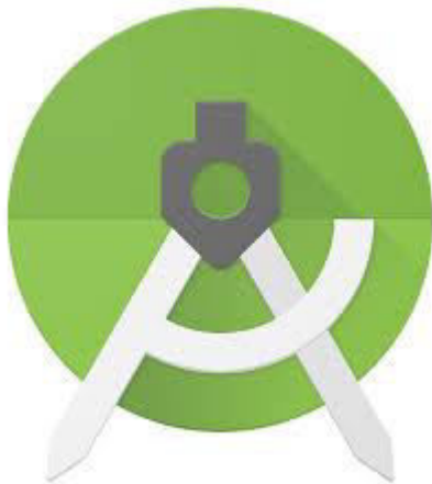
Fig 2.Android Studio

Android Studio is the official integrated development environment (IDE) for Google's Android operating system, built on JetBrains' IntelliJ IDEA software and designed specifically for Android development. It is available for download on Windows, macOS and Linux based operating systems. It is a replacement for the Eclipse Android Development Tools (ADT) as the primary IDE for native Android application development.